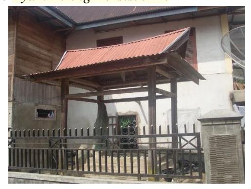
Figure 1. Tomb of Depati Mangkubumi

This tomb (Figure 1) is located in Siulak Panjang Village, Siulak District. Depati is a term used for the highest position in the Kerinci. Depati heads the country or hamlet from the same hamlet. Depati Mangkubumi is one of the descendants of Gento Suri, a child from Imam Bajeli and Puri Sedayu. Depati Mangkubumi came to power in the 17th century AD Depati was based in Siulak Panjang. Depati Mangku Bumi Putih White The Barajo Tribe is a Warrior who also has the title Ayam Biring Bersisik 21 .