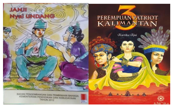
Figure 2 Published Book Regarding His Legend Invites

Legend of Nyai Undang has historical value. All of these contributed to the historical writing of the area of Kapuas Regency, Central Kalimantan. One thing that needs to be observed if it is used as a source in historical writing, it is necessary to source criticism so that the value of historical scholarship can be justified. In this case it requires precision and sharpness in producing interpretations.