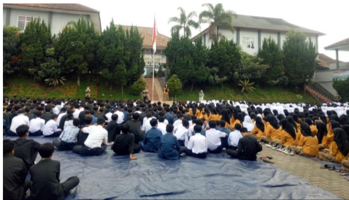
Mengisi Angket Kuesioner